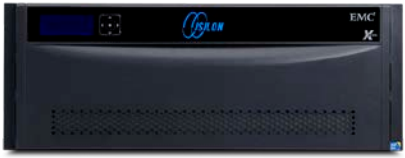
EMC Isilon X400