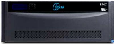
EMC Isilon NL400