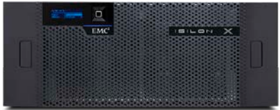
EMC Isilon X410