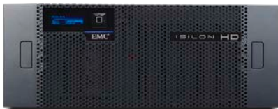
EMC Isilon HD400

The Isilon HD-Series is designed to provide enterprises with a highly efficient and resilient scale-out storage platform for unstructured data that can scale to over 50 PB in a single file system. With massive scalability, robust data protection options and a high density footprint that lowers operating costs by 50%, the Isilon HD-Series is ideal for Big Data storage needs including deep archiving solutions.